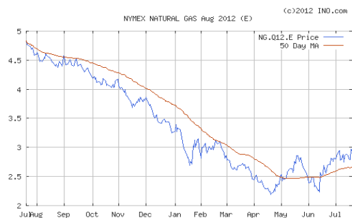
Above Graph – August 2012 NYMEX gas futures

The Crude oil price for August is higher this week at $91.32 per barrel. Heating oil is higher at $2.91 per gal. Unleaded gasoline futures are higher this week at $2.80 and gasoline at the pump is around $3.69...in Indiana. The natural gas storage report this week was an injection of 28 BCF; storage is 509BCF higher than last year and 470 BCF higher than the 5 year average.