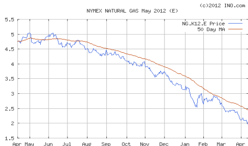
Above Graph – May 2012 NYMEX gas futures

The Crude oil price for May is lower this week at $102.80 per barrel. Heating oil is lower at $3.11 per gal. Unleaded gasoline futures are lower this week at $3.29 and gasoline at the pump is around $4.05...in Indiana. The natural gas storage report today was an injection of 8 BCF; storage is 888 BCF higher than last year and 920 BCF higher than the 5 year average.