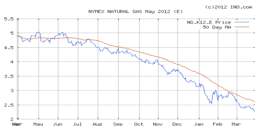
Above Graph – May 2012 NYMEX gas futures

The Crude oil price for May is lower this week at $104.62 per barrel. Heating oil is higher at $3.21 per gal. Unleaded gasoline futures are higher this week at $3.37 and gasoline at the pump is around $4.39...in Indiana. The natural gas storage report today was an injection of 57 BCF; storage is 816 BCF higher than last year and 900 BCF higher than the 5 year average.