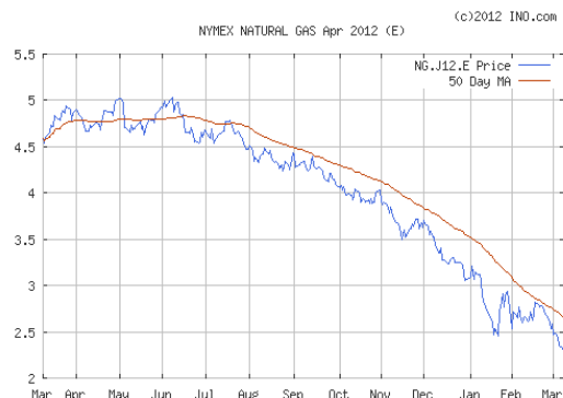
Above Graph – Apr 2012 NYMEX gas futures

The Crude oil price for March is lower this week at $106.46 per barrel. Heating oil is higher at $3.24 per gal. Unleaded gasoline futures are higher this week at $3.31 and gasoline at the pump is around $3.89...in Indiana. The natural gas storage report today was a withdrawal of 80 BCF; storage is 739 BCF higher than last year and 792 BCF higher than the 5 year average.