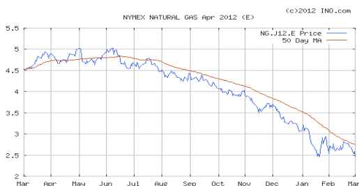
Above Graph – Apr 2012 NYMEX gas futures

The Crude oil price for March is higher this week at $107.73 per barrel. Heating oil is lower at $3.21 per gal. Unleaded gasoline futures are higher this week at $3.29 and gasoline at the pump is around $3.85...in Indiana. The natural gas storage report today was a withdrawal of 82 BCF; storage is 756 BCF higher than last year and 780 BCF higher than the 5 year average.