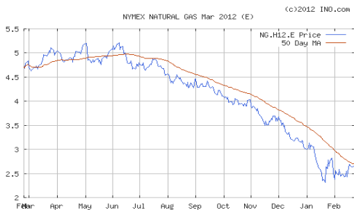
Above Graph – Mar 2012 NYMEX gas futures

The Crude oil price for March is higher this week at $105.89 per barrel. Heating oil is higher at $3.27 per gal. Unleaded gasoline futures are higher this week at $3.26 and gasoline at the pump is around $3.69...in Indiana. The natural gas storage report today was a withdrawal of 166 BCF; storage is 753 BCF higher than last year and 744 BCF higher than the 5 year average.