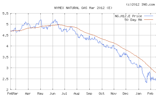
Above Graph – Mar 2012 NYMEX gas futures

The Crude oil price for March is higher this week at $101.58 per barrel. Heating oil is lower at $3.18 per gal. Unleaded gasoline futures are higher this week at $3.18 and gasoline at the pump is around $3.49...in Indiana. The natural gas storage report today was a withdrawal of 127 BCF; storage is 817 BCF higher than last year and 765 BCF higher than the 5 year average.