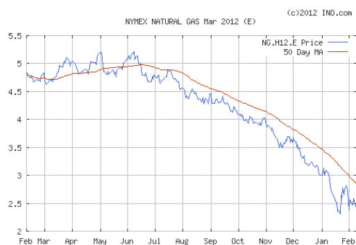
Above Graph – Mar 2012 NYMEX gas futures

The Crude oil price for March is higher this week at $99.83 per barrel. Heating oil is higher at $3.19 per gal. Unleaded gasoline futures are higher this week at $3.00 and gasoline at the pump is around $3.59...in Indiana. The natural gas storage report today was a withdrawal of 78 BCF; storage is 714 BCF higher than last year and 714 BCF higher than the 5 year average.