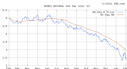
Above Graph – Mar 2012 NYMEX gas futures

The Crude oil price for March is lower this week at $96.62 per barrel. Heating oil is higher at $3.06 per gal. Unleaded gasoline futures are higher this week at $2.88 and gasoline at the pump is around $3.39...in Indiana. The natural gas storage report today was a withdrawal of 132 BCF; storage is 586 BCF higher than last year and 601 BCF higher than the 5 year average.