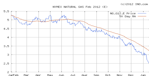
Above Graph – Feb 2012 NYMEX gas futures

The Crude oil price for February is lower this week at $101.46 per barrel. Heating oil is lower at $3.03 per gal. Unleaded gasoline futures are higher this week at $2.84 and gasoline at the pump is around $3.45...in Indiana. The natural gas storage report today was a withdrawal of 87 BCF; storage is 539 BCF higher than last year and 566 BCF higher than the 5 year average.