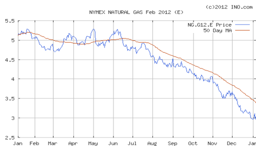
Above Graph – Feb 2012 NYMEX gas futures

The Crude oil price for February is higher this week at $102.44 per barrel. Heating oil is higher at $3.07 per gal. Unleaded gasoline futures are higher this week at $2.75 and gasoline at the pump is around $3.49...in Indiana. The natural gas storage report today was a withdrawal of 76 BCF; storage is 356 BCF higher than last year and 458 BCF higher than the 5 year average.