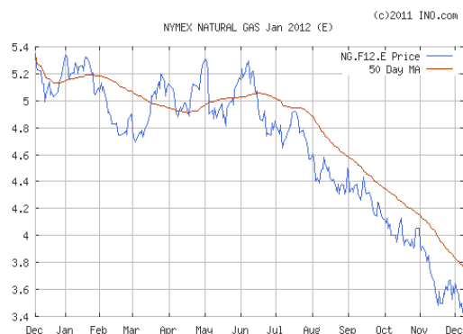
Above Graph – Jan 2012 NYMEX gas futures

The Crude oil price for January is lower this week at $98.89 per barrel. Heating oil is lower at $2.96 per gal. Unleaded gasoline futures are lower this week at $2.56 and gasoline at the pump is around $3.29...in Indiana. The natural gas storage report today was a withdrawal of 20 BCF; storage is 102 BCF higher than last year and 307 BCF higher than the 5 year average.