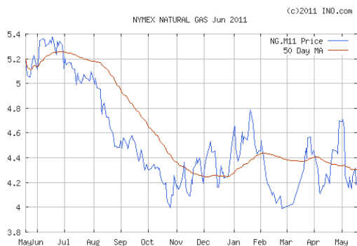
Above Graph – June 2011 NYMEX gas futures

The Crude oil price for June is higher this week at $99.94 per barrel. Heating oil is higher at $2.91 per gal. Unleaded gasoline futures are lower this week at $2.98 and gasoline at the pump is around $4.09...in Indiana. The natural gas storage report today was an injection of 92 BCF. Storage is 235 BCF lower than last year and 36 BCF lower than the 5 year average.