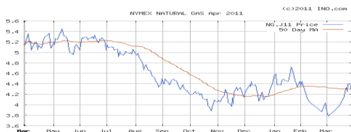
Above Graph – May 2011 NYMEX gas futures

The Crude oil price for May is higher this week at $106.22 per barrel. Heating oil is higher at $3.10 per gal. Unleaded gasoline futures are higher this week at $3.11 and gasoline at the pump is around $3.59...in Indiana. The natural gas storage report today was an injection of 12 BCF. Storage is 12 BCF lower than last year but 68 BCF higher than the 5 year average.