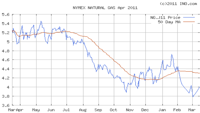
Above Graph – April 2011 NYMEX gas futures