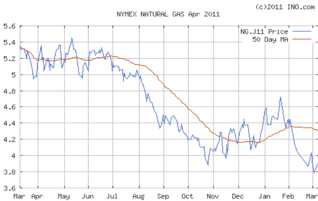
Above Graph – April 2011 NYMEX gas futures