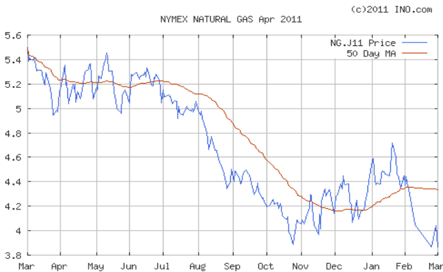
Above Graph – April 2011 NYMEX gas futures